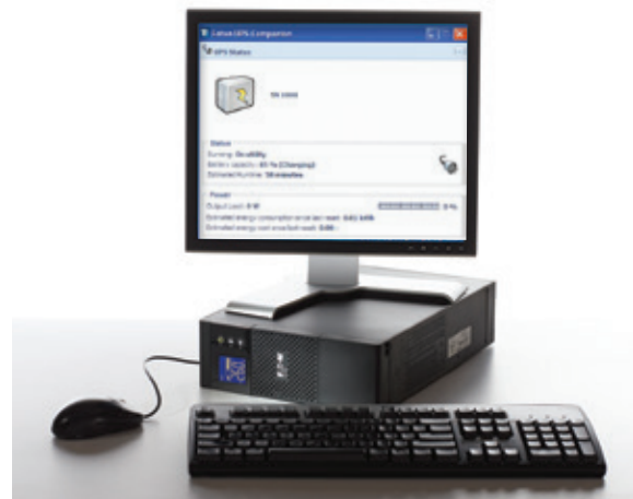
The 5S fits in small spaces and can also be used as a monitor stand.